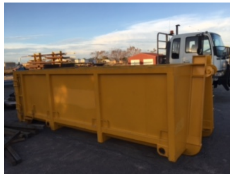
Large Range 12 cubic metres plus