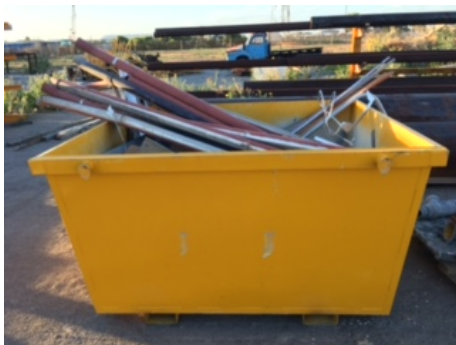
Medium Range 3 to 10 cubic metres

This style of bin has been cleverly designed so that the forklift operator does not have to get off the forklift whilst emptying the bin.